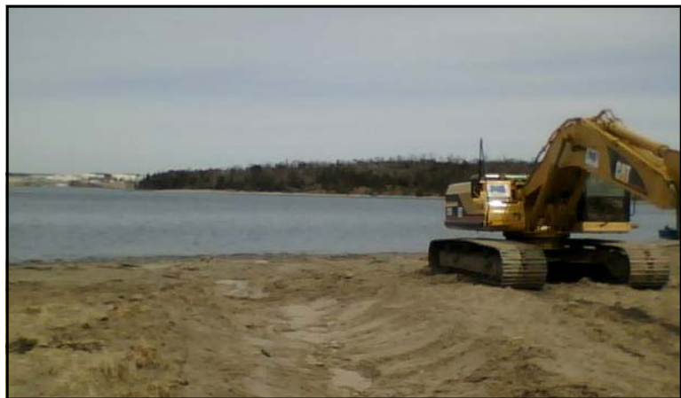
Old Site of Range Pier