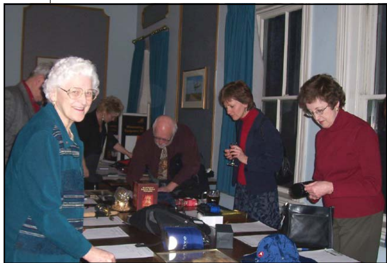
Friends admiring the Auction Items