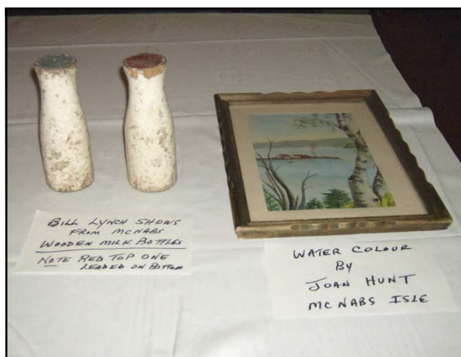
Artifacts of McNabs Island on display at the Dinner & Auction courtesy of Bill Mont